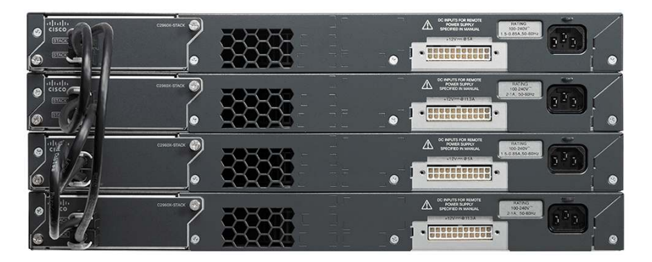
Figure 2. Cisco FlexStack-Plus Switch Stack